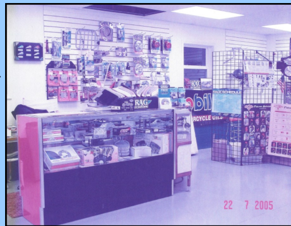
Counter at McCord's All American Cycle Shop