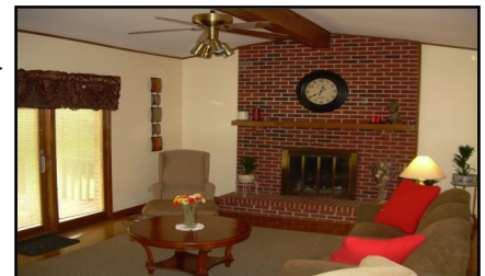
From top to bottom: Outside view of Novi Attendant Care Home; Family room with fire place and walk out to deck.