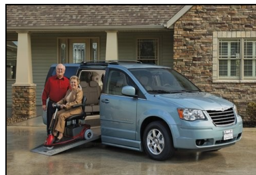
Van ramp installed by Advantage Mobility Outfitters.

Advantage Mobility Outfitters are members of the National Mobility Equipment Dealers Association (N.M.E.D.A.) as well as one of the select few that have been certified to their Quality Assurance Program (QAP). Our technicians train, study and understand mobility technologies and are re-certified every two years. Many of their clients have become disabled as a result of motorcycle and car accidents, workers compensation cases as well as individuals with MD, MS, ALS, and amputation injuries. Patients are often referred to them by attorneys, insurance companies, case managers, social workers, hospital discharge planners, OT's and PT's.